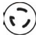
Nema L6-30 Twist