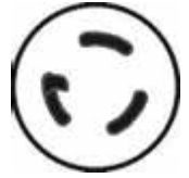
Nema L6-30 Twist